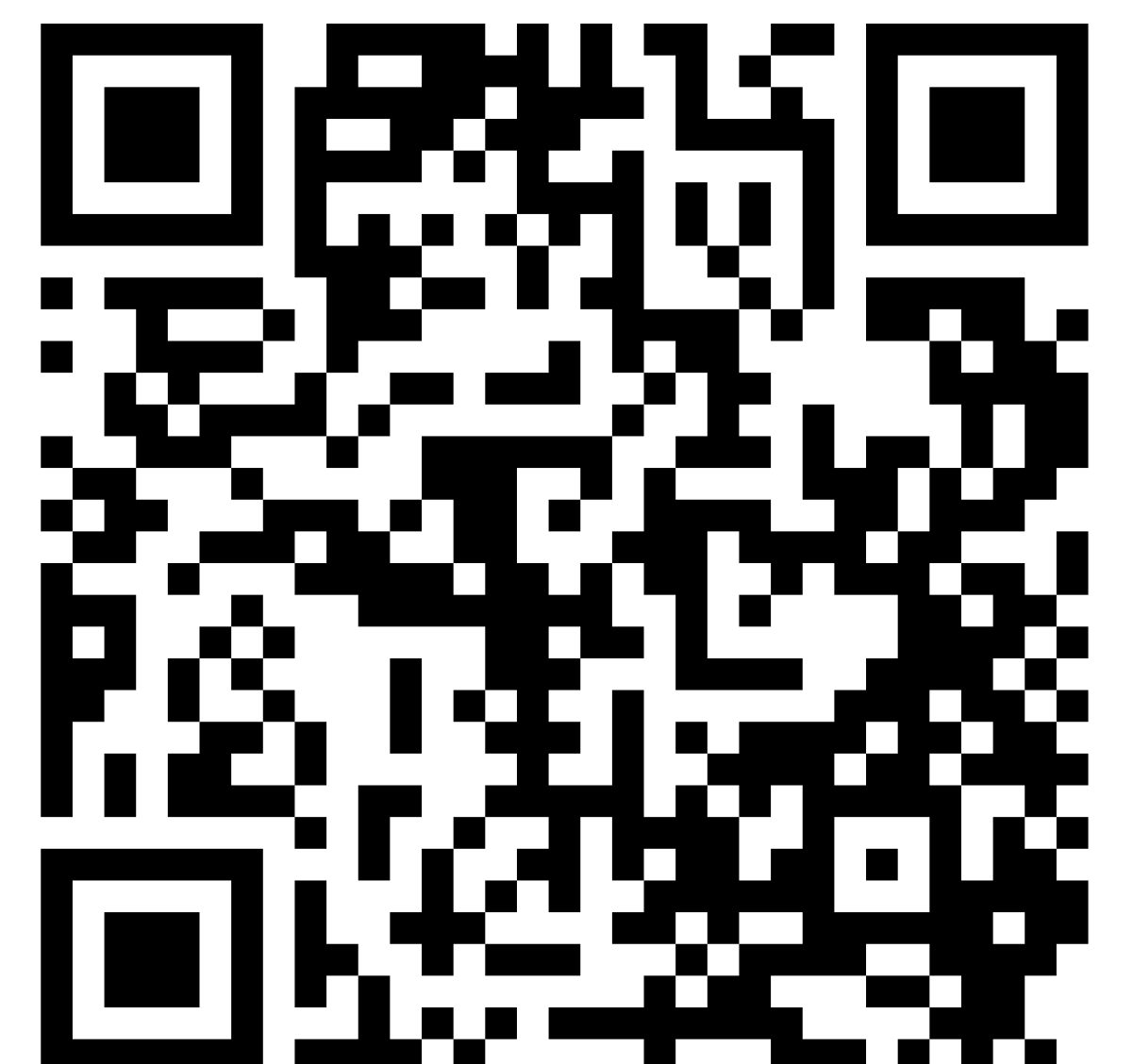
See More Projects