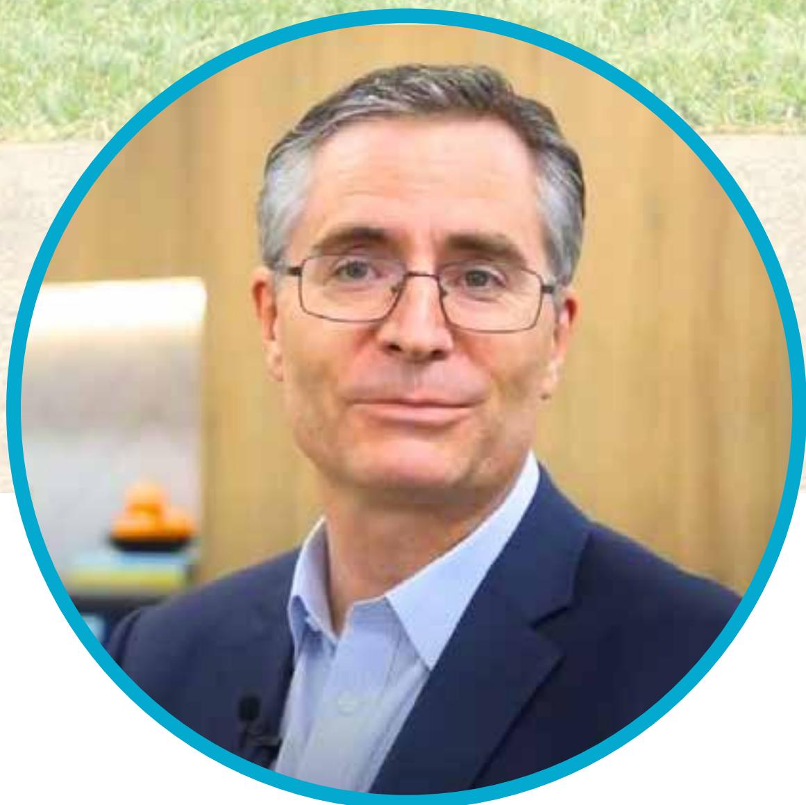
Douglas Partners Client